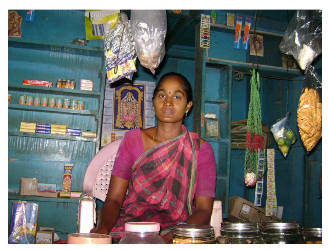
4) KR Peta Gramiya Sakhyam: This village level MAC works for 21 villages, the organisation has 21 self- help groups and has 298 members.