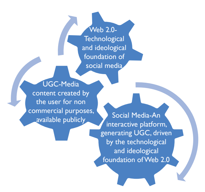
Figure 1. Diagrammatic Representation of Interconnection of Social Media, UGC and Web 2.0

says: scalability is cost-effective; data gets richer with more users collaborating; trusting users for co-creation and collective intelligence; openness; development of microcontent; wisdom of crowds (Alexander, 2006; O'Reilly, 2007).