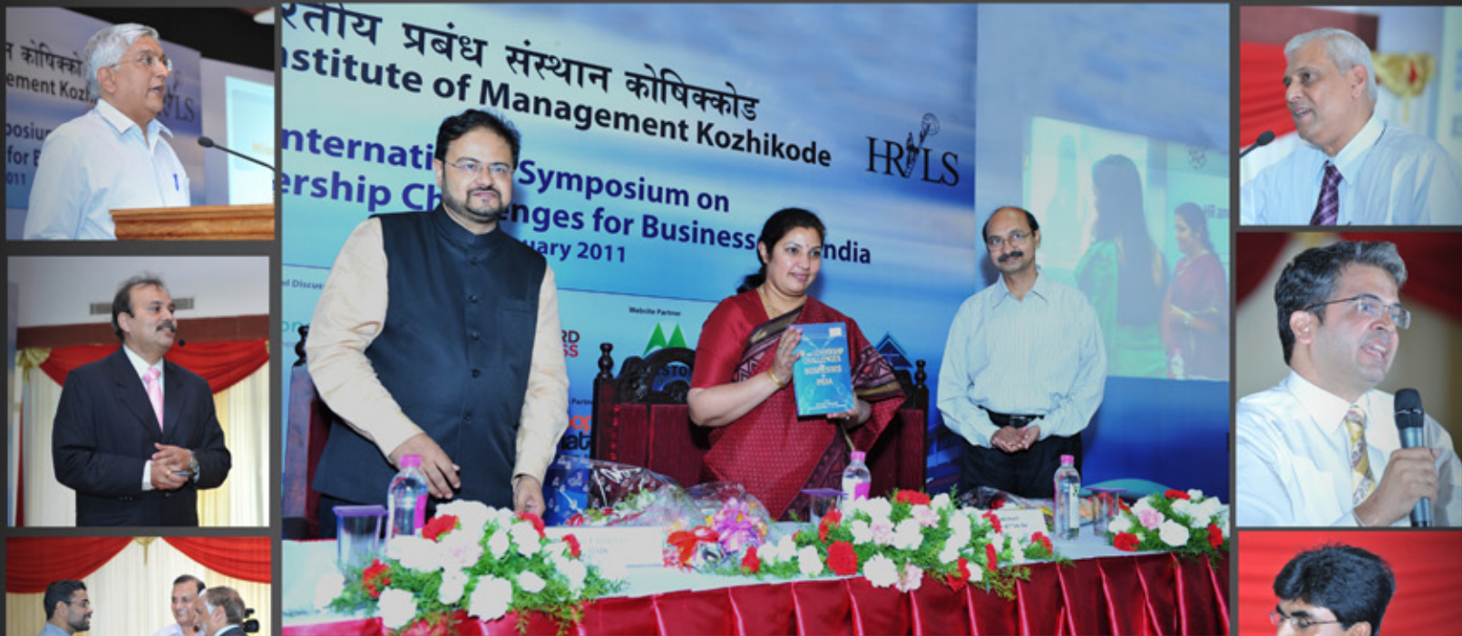
Dr. Daggubati Purandeswari, Minister of State for HRD (Higher Education) releasing the proceedings of International Symposium on HRLS, HR & Leadership Challenges for Businesses in India. P6