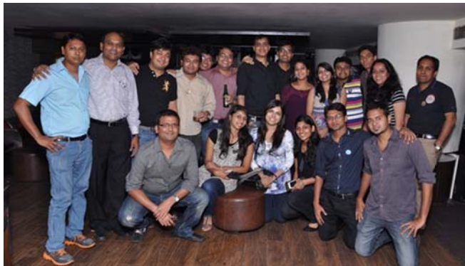
Sangam @ Kolkata

The event saw participation from over 200 people gathering to celebrate the alumni reunion. Special mention should