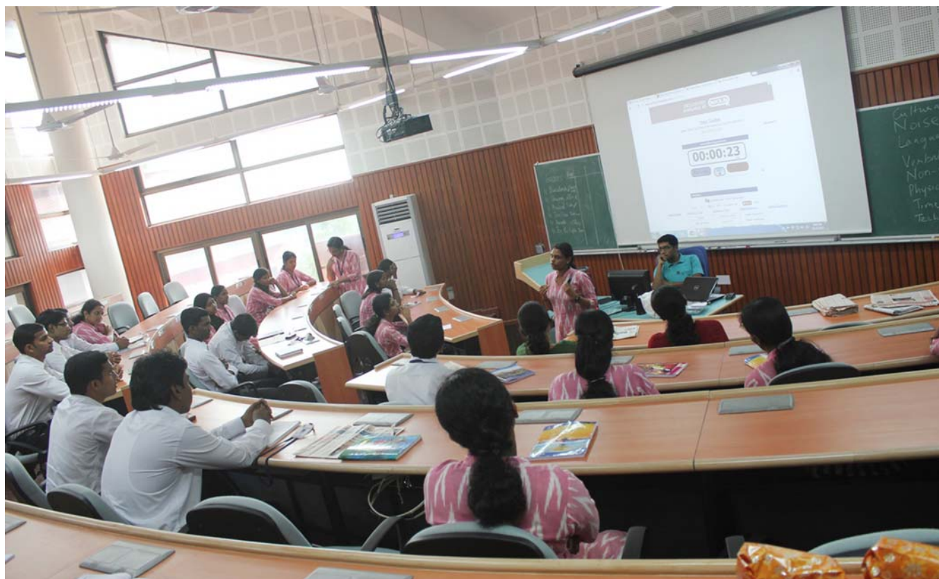
Peer level mentoring session progressing at IIMK