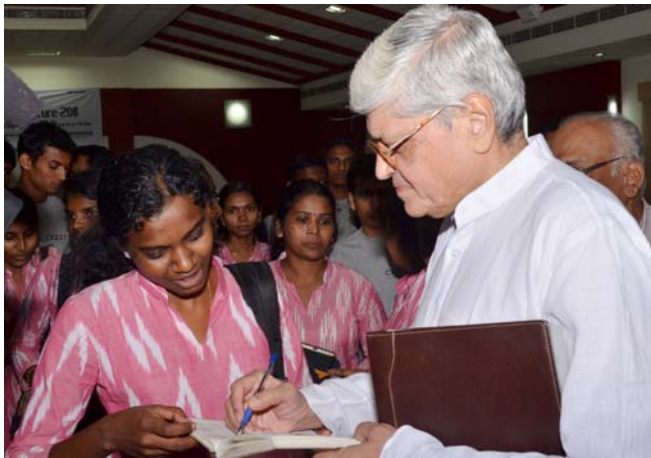
Gopal Gandhi, Former WB Governor (Grandson of Mahatma Gandhi) interacting with CREST students