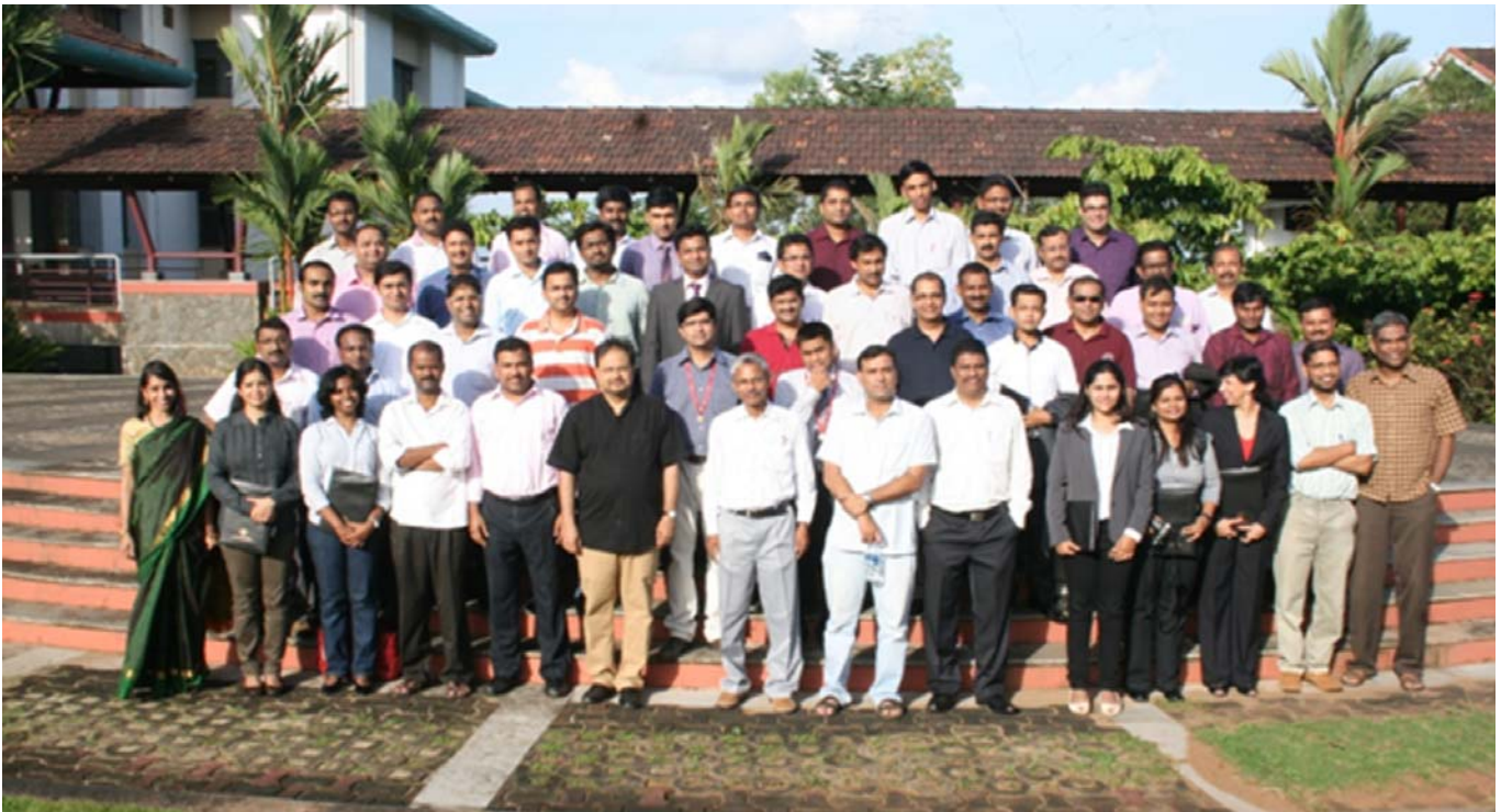
Participants of EEPGM-11, EEPSM-04, EEPM-04, EEPF-04, EEPOM-04 with Director, Dean (Academic), Chair-EPGP and Faculty Members