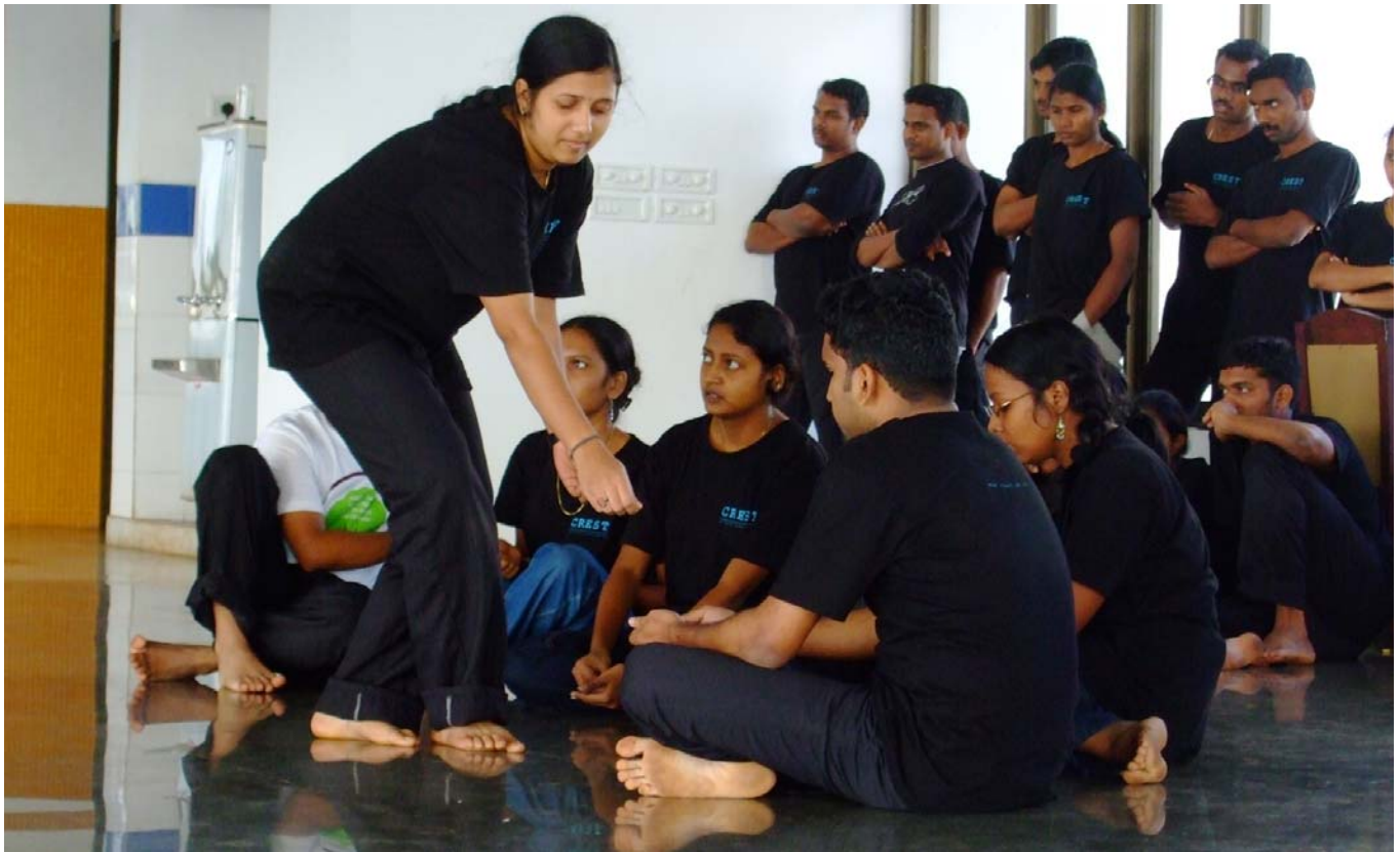
Theatre Workshop at IIMK

CREST publishes a tri-annual electronic newsletter “CREST News Bulletin” to showcase its activities, copies of which can be accessed from the website of CREST www.crest.ac.in