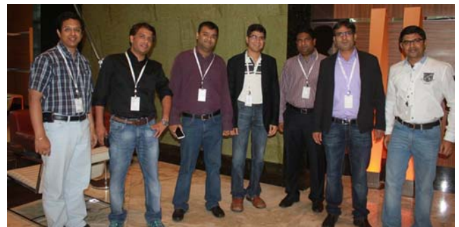
Sangam @ Dubai

Email ids - Requesting to issue IIMK email ids to alumnus across the globe such as alums name@alumni.iimk.ac.in to create further bonding between the alums and the institute.