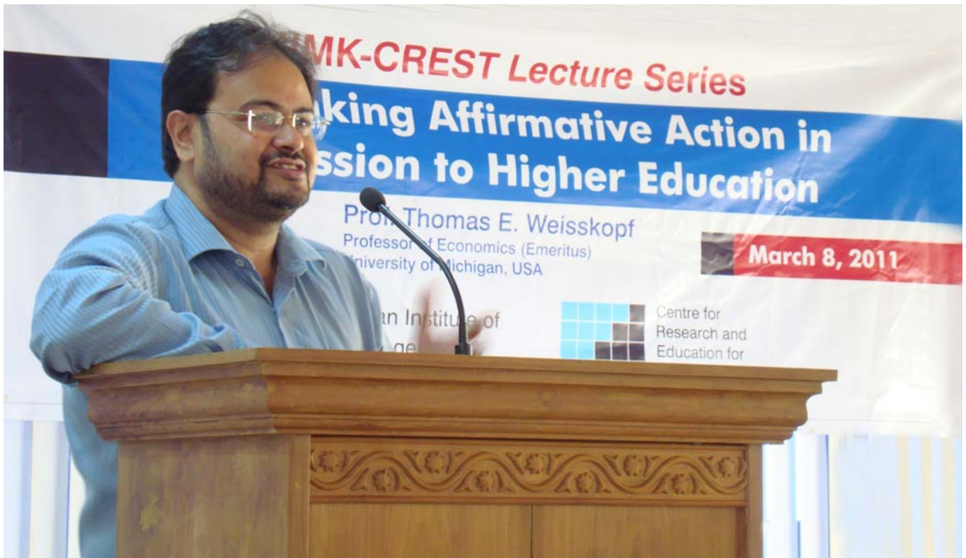
IIMK Director speaking at CREST-IIMK Lecture Series

Centre for Research and Education for Social Transformation (CREST)