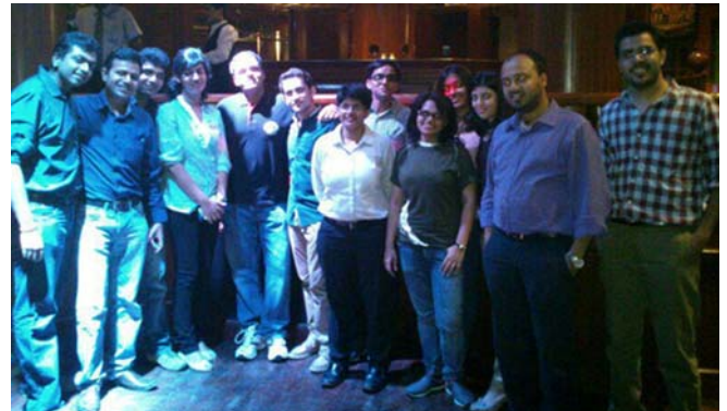
Sangam @ New Delhi

Online Payment Portal - Requesting to create an online payment portal within the alumni website for convenient