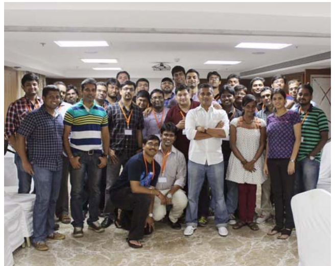
Sangam'14 at Chennai

stressed on the need of faculty members to take up alumni affairs on priority considering the growing concerns of an Association to keep all of them intact under one concrete platform and channelizing its formation at an earliest date. They feel it's highly imperative to boost the placements