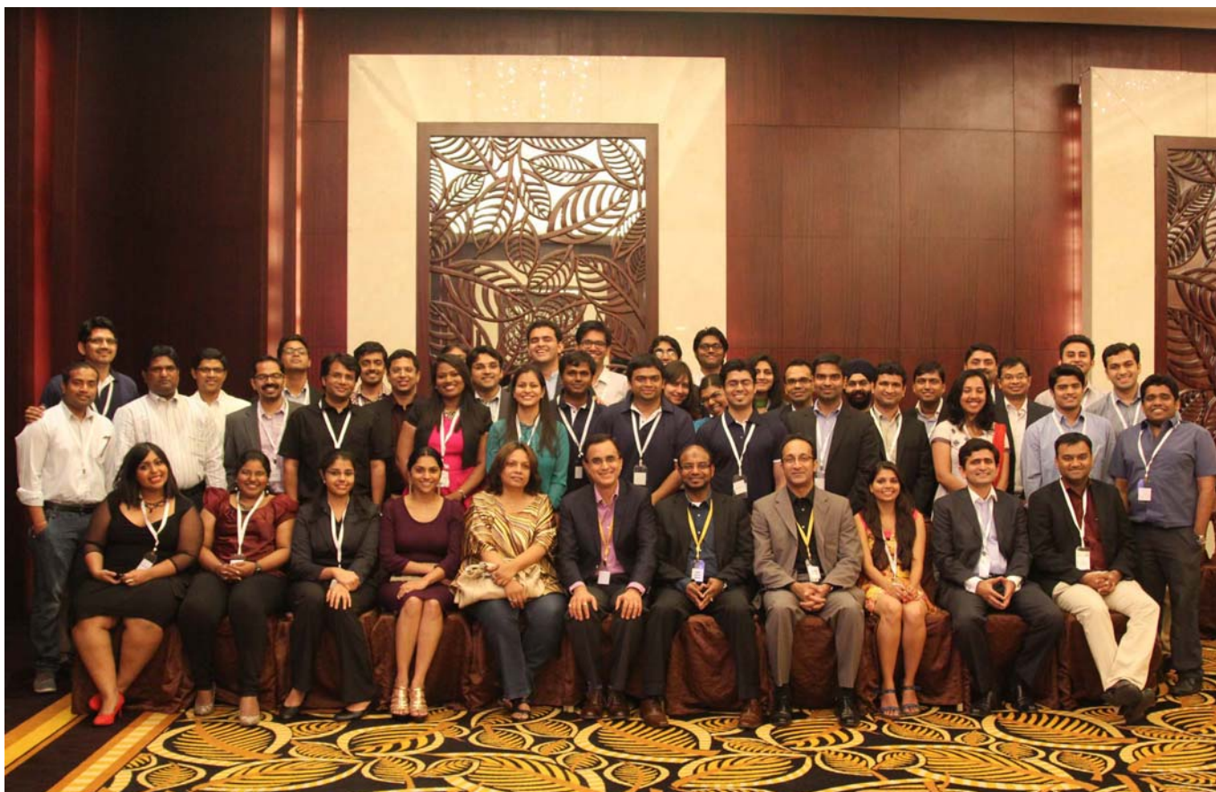
Sangam'14 at Dubai