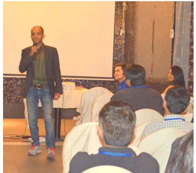
Sangam'14 at Mumbai