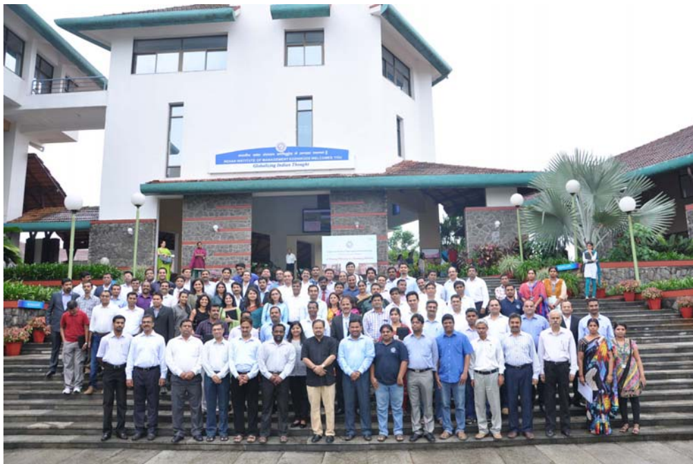
Graduating students with Director, Dean (Academic), Chairman-EPGP, Faculty Members & Staff