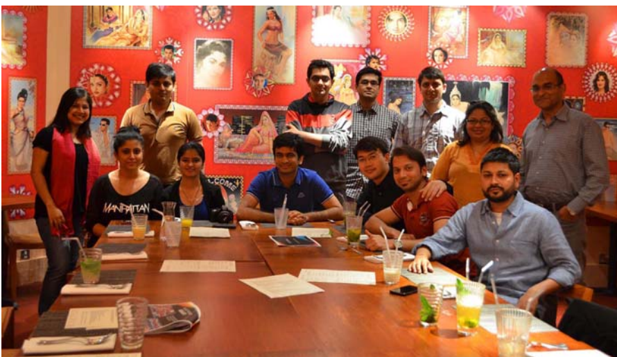
Sangam'14 at London

other ways to connect the institute and the alumni. The Alumni Committee extends a vote of thanks to all the students and the alumni at international locations who helped pull off the event on such a grand scale and hopes to serve the institute and the alumni much better in the coming years. As of now, the committee looks forward to have more alumni speakers to attend the current batches in the campus and waits in anticipation for Nostalgia 2015 which will celebrate the 10 th anniversary of PGP07 in all their glory.