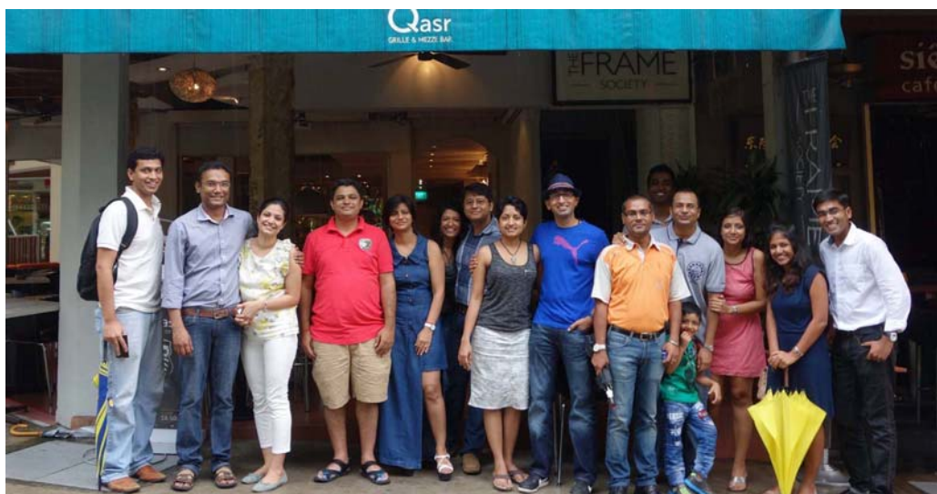
Sangam'14 at New York

The event witnessed a great participation in great numbers exceeding the participation of previous years in all the cities, be it in India or abroad