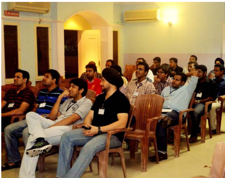
Sangam'14 at Bangalore

such alumni was conducted. The entrepreneurs spoke about how they conceived the ideas, how they gave shape to them, the hardships faced, struggles they had to overcome, and eventually how they succeeded. This was truly very inspiring for everyone, especially the current batch of students, many of whom have long term plans of becoming an entrepreneur.