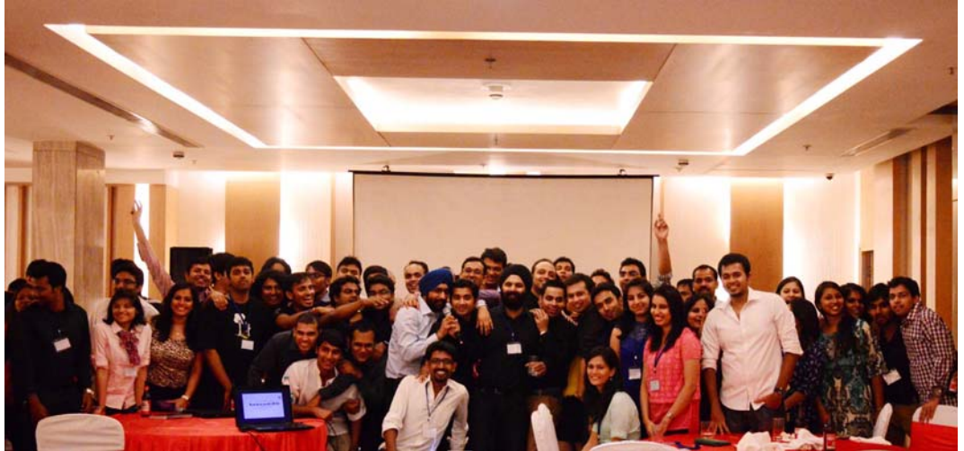
Sangam'14 at Delhi

SANGAM, the annual alumni reunion of IIM Kozhikode organized by the institute's Alumni Committee, brings together the prestigious alumni IIMK during May/June of every year. This year, the event was conducted across 7 cities in India namely, Bangalore, Mumbai, Chennai, Delhi, Hyderabad, Kochi, Kolkata, and 4 international locations – London, Singapore, New York and Dubai.