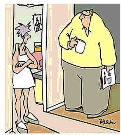
"It's just the fashion, Dad. Relax – don't be going all Taliban on me."